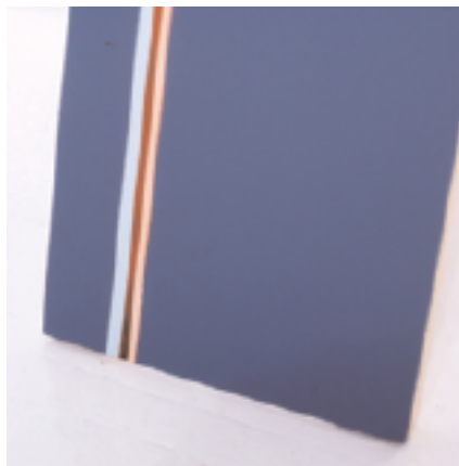
Josh's Garage, detail of 1 of 4 paintings, enamel on board, 2000