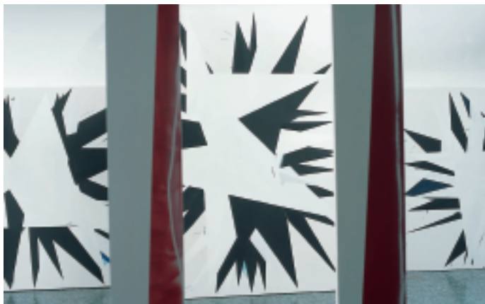
Agnosia, installation view, 2002

Centre image Alma VIII, Jarama and Ain-Diab, detail of installation, 2002