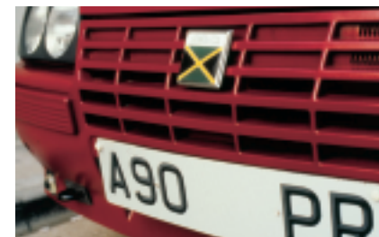
Multinational Anthem BBBMW, R-type print on aluminium, 2002