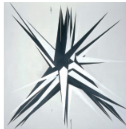
Alma XVIII, acrylic on canvas, 2002