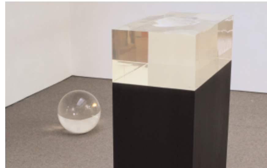
'Peckham Pothole', acrylic cast, stainless steel, walnut veneer plinth, 2002